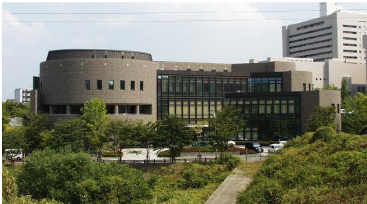
Icho kaikan ( Osaka Univ. )